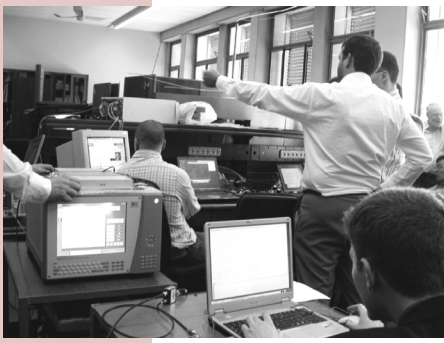
Figure 2: Common lab test session in Turku, Finland