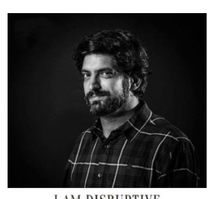
I AM DISRUPTIVE

For more information and for interest to participate please contact: