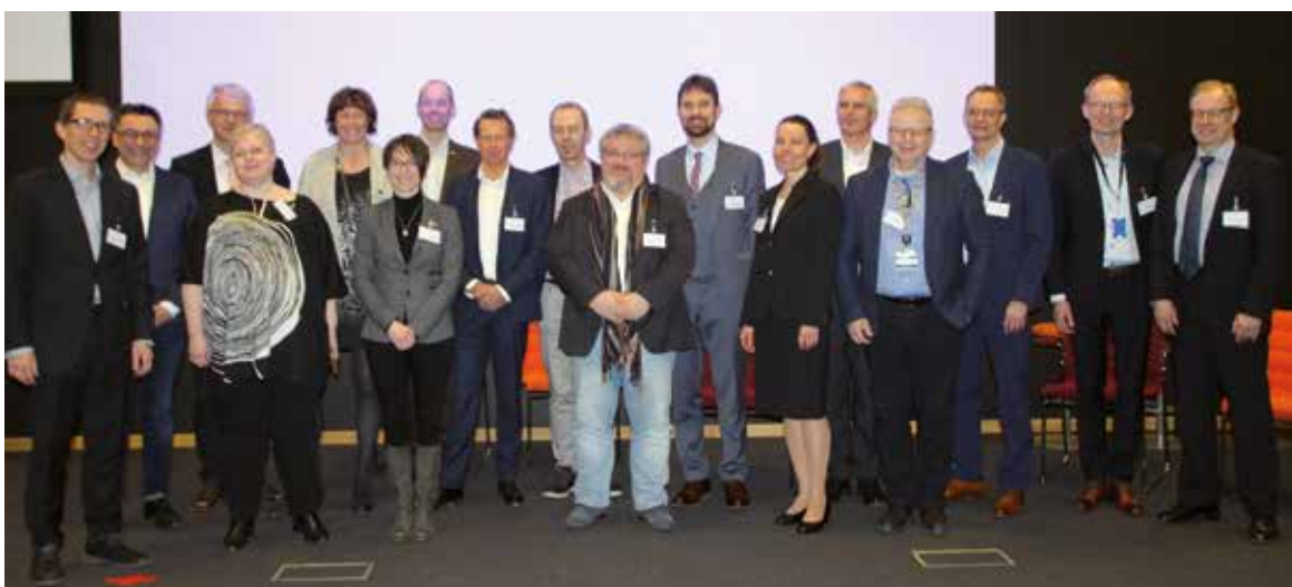
All the speakers who made the SENDATE Closing Event a success.