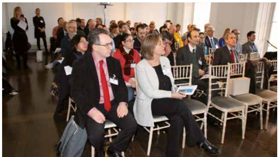
Audience of the Proposers Day in the Meeting room in the Institute of Contemporary Arts in London

society. Today, the main researched topics in Germany are production systems (Industry 4.0), energy systems for the future and social systems able to cope with demographic changes.