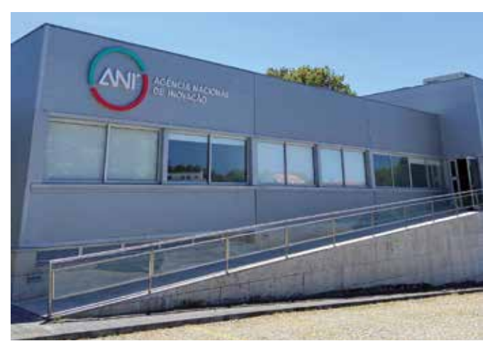
ANI headquarters in Porto