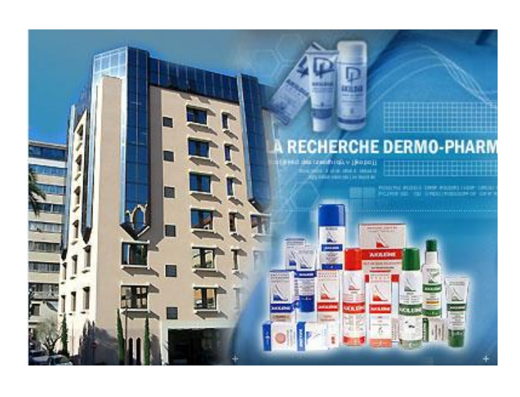
Laboratories ASEPTA / SACOME CONTI ...