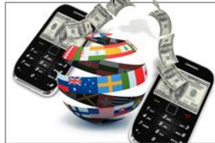
Mobile Financial Apps