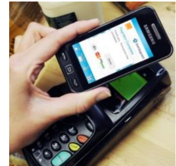
Mobile Financial Apps