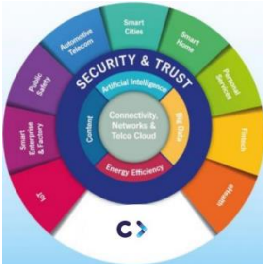
Figure 1: CELTIC-NEXT Research Topics

Topics currently high on the ICT agenda are for example Internet of Things, Artificial Intelligence and Big Data, Privacy and Security, 5G+ and verticals (such as Smart Transportation, Smart Industry, Smart Health and Smart Cities).