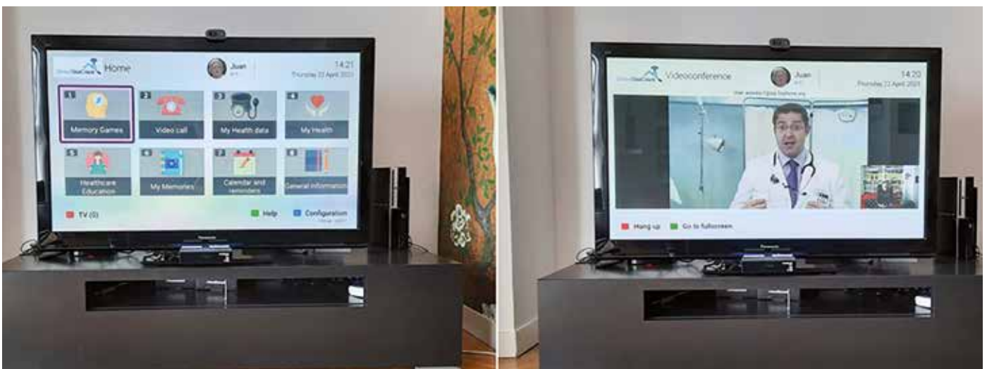
E3 project: User-friendly experience / Videoconference at Home TV

Three start-ups have been created to commercialize E3 project developments, including SMART Health TV solutions in Spain which is participating in the ESA Space COVID19 Response Initiative as provider of tele-care technology for CNR (Consiglio Nazionale delle Ricerche).