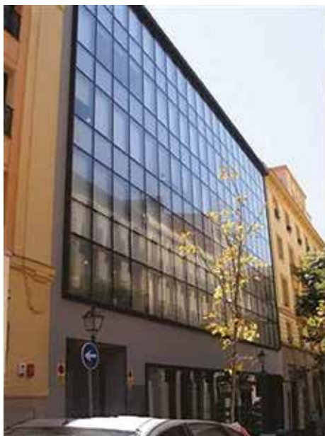
CDTI premises in Madrid

In order to accelerate the time to contract of CELTIC projects, CDTI has a new funding procedure that forces Spanish companies to apply for funding as soon as Celtic projects are labelled. Spanish funding application is done in two phases: First, the leader of the Spanish sub-consortium applies a 'Eureka request' after the deadline of each CELTIC-NEXT call (margin: 15 days). Second, once the projects are labelled, each company involved in la-