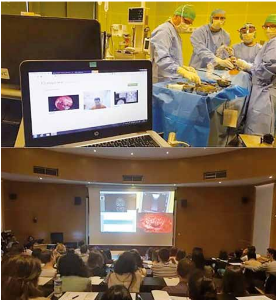
E3 medical test video sequence

belled projects presents the full memory (national request) with a margin of 20 days. This improved process will avoid long-term funding procedures for CELTIC projects and will shorten time-to-contract.