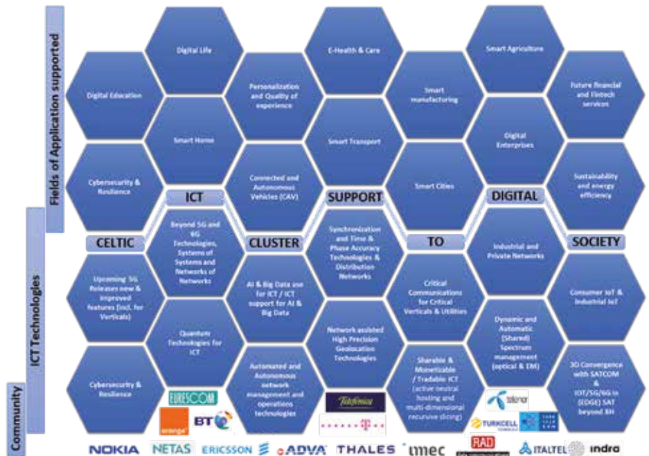
Topical areas of the CELTIC-NEXT Roadmap 2021-2025

The theme of CELTIC-NEXT for the new period is: "Next-Generation Communications for a secured, trusted, and sustainable digital society". All topics identified in the strategic roadmap of CELTIC-NEXT for the 2021-2025 period have been aligned under this theme. These topics are neither comprehensive nor prescriptive. In line with the bottom-up approach of CELTIC-NEXT, projects are free to explore