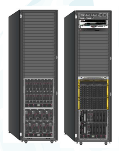
First FIWAT node in Spain