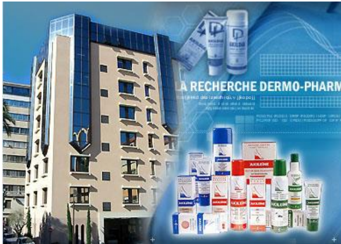
Laboratories ASEPTA / SACOME CONTI ...