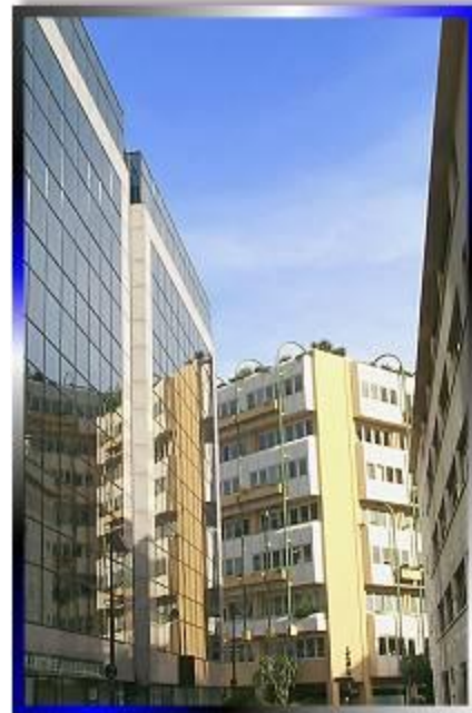
MECAPLAST / THERAMEX / BANANA MOON / LANCASTER .