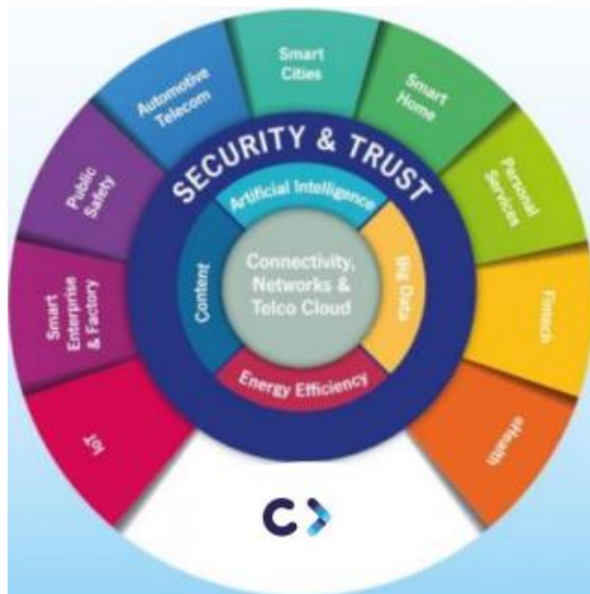
Figure 1: CELTIC-NEXT Research Topics

Topics currently high on the ICT agenda are for example Internet of Things, Artificial Intelligence and Big Data, Privacy and Security, 5G+ and verticals (such as Smart Transportation, Smart Industry, Smart Health and Smart Cities).