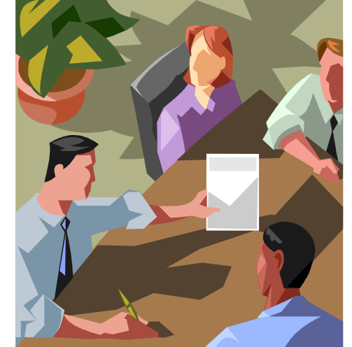
Technology Group Executive Committee