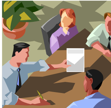
Technology Group Executive Committee