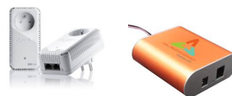
Devolo and Oledcomm products

An important condition for the success of this project is to move from standards and project demonstrators to real products.. It is an ambition of ACEMIND manufacturers and operator to introduce innovation to the market such as Hybrid Plug from Devolo which provide latest 1905.1 features and LiFiNet product from Oledcomm, the first industrial full duplex optical wireless communication system.