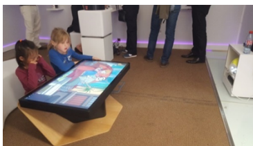
ACEMIND @ Roland Garros (Paris-2016)

◆ Dashboard: ACEMIND dashboard shows a complete view of customer's devices at home, like ICT device, white product and home automation sensor. The dashboard comprises as well an