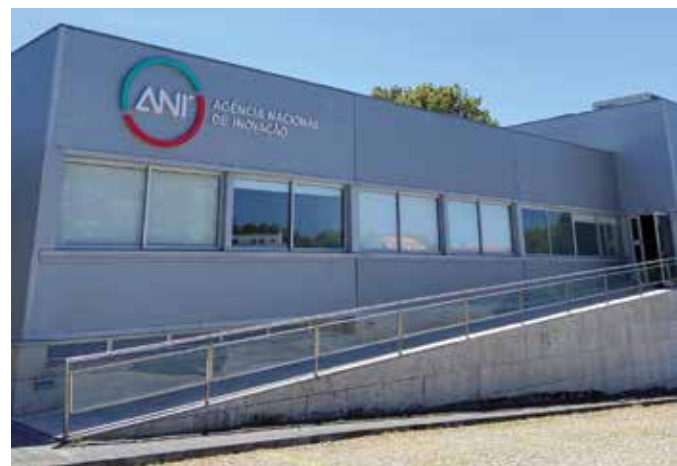
ANI headquarters in Porto